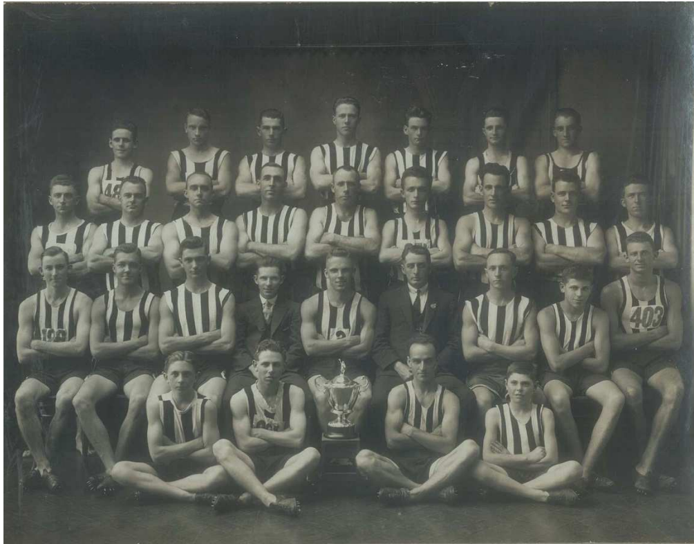
Winners Thompson Cup, 1924-25

In 1924-25 the N.S.W.A.A.A. commenced the Men's A Grade Inter-Club Competition and Western Suburbs A.A.C. were the premiership winner of the P.E. Thompson Cup.